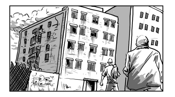
With full determination, Brannigan heads for a RUN-DOWN HOUSE.