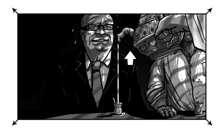
THE SHEIK (O.S.): You 'took care of' the only person who knew the hacker of the PNAH-sequence!?