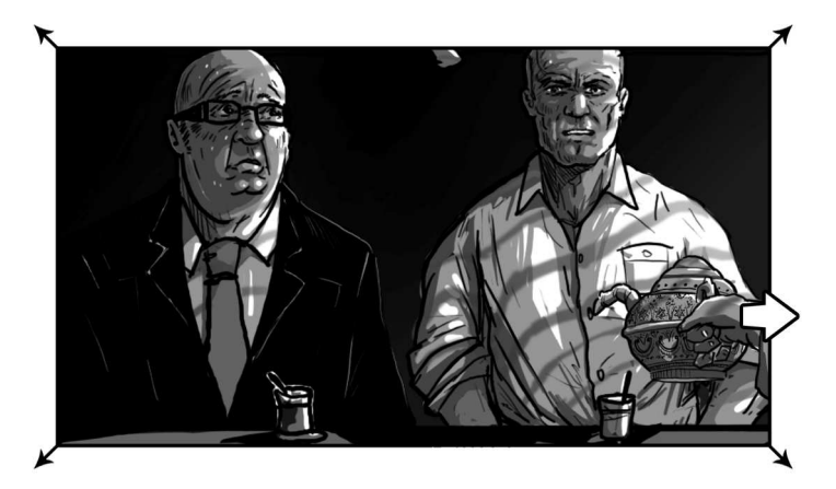
BRANNIGAN: We couldn't take the risk of another unauthorized transfer.