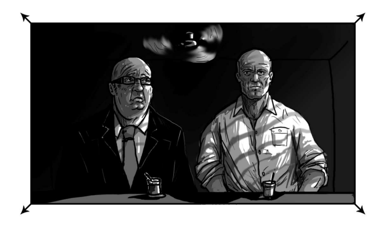
THE SHEIK (O.S.): Conflicts always contain knowledgeable potential. When they get 'taken care of', we loose